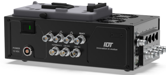
XStream Time Capsule